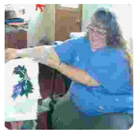
"All my before pictures are fuzzy!"

Throughout my life I have prayed to be delivered from this prison of a body. I didn't want to be Miss America, or a beauty gueen. Just normal, like everybody else, and invisible. I wanted to be able to walk